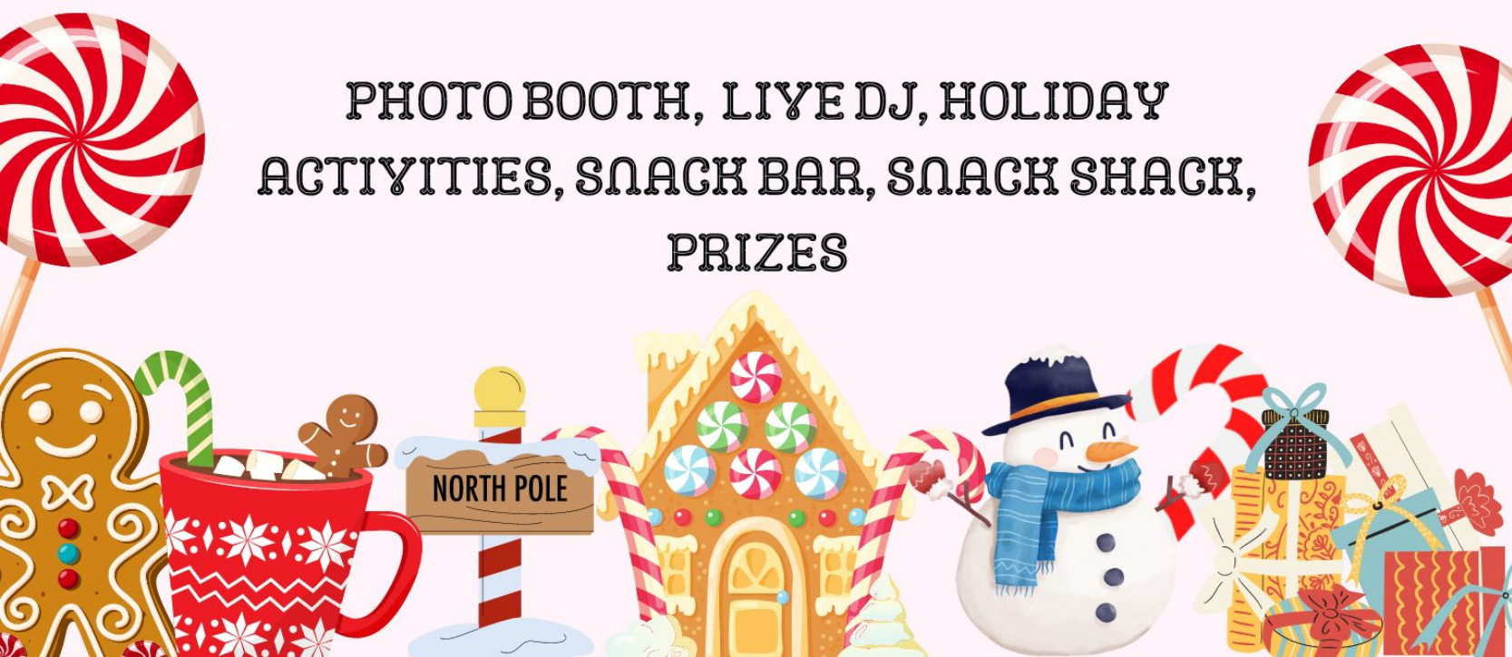
PHOTO BOOTH, LIVE DJ, HOLIDAY ACTIVITIES, SNACK BAR, SNACK SHACK, PRIZES

DATES OF TICKET SALES: 12/7, 12/9, 12/12, 12/14, DURING LUNCH ON THE YARD.