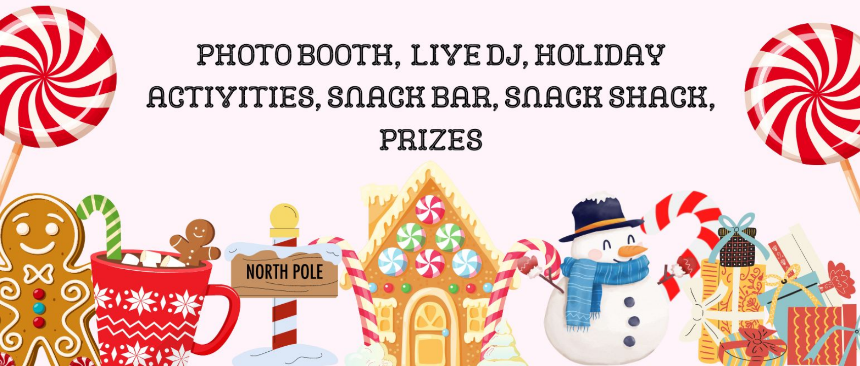
PHOTO BOOTH, LIVE DJ, HOLIDAY ACTIVITIES, SNACK BAR, SNACK SHACK, PRIZES

DATES OF TICKET SALES: 12/7, 12/9, 12/12, 12/14, DURING LUNCH ON THE YARD.