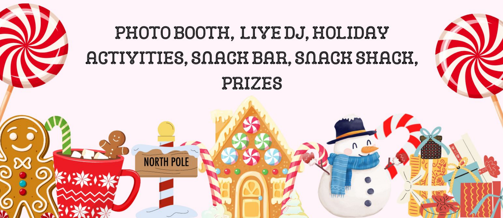
PHOTO BOOTH, LIVE DJ, HOLIDAY ACTIVITIES, SNACK BAR, SNACK SHACK, PRIZES

DATES OF TICKET SALES: 12/7, 12/9, 12/12, 12/14, DURING LUNCH ON THE YARD.