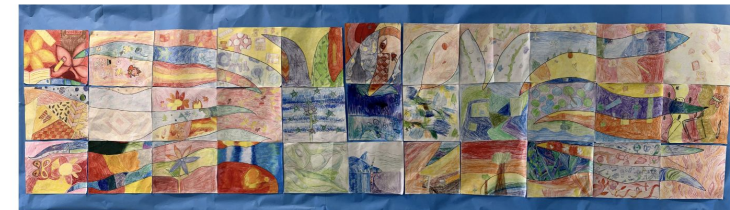
7th Grade Tree of Color