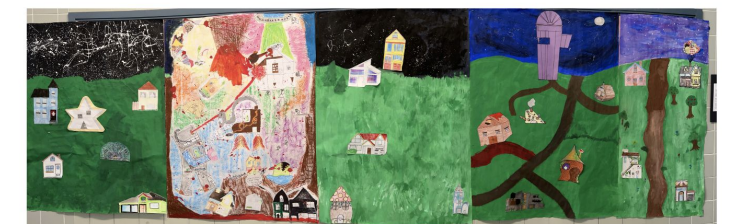
8th Grade Mini Moon City - Alienator